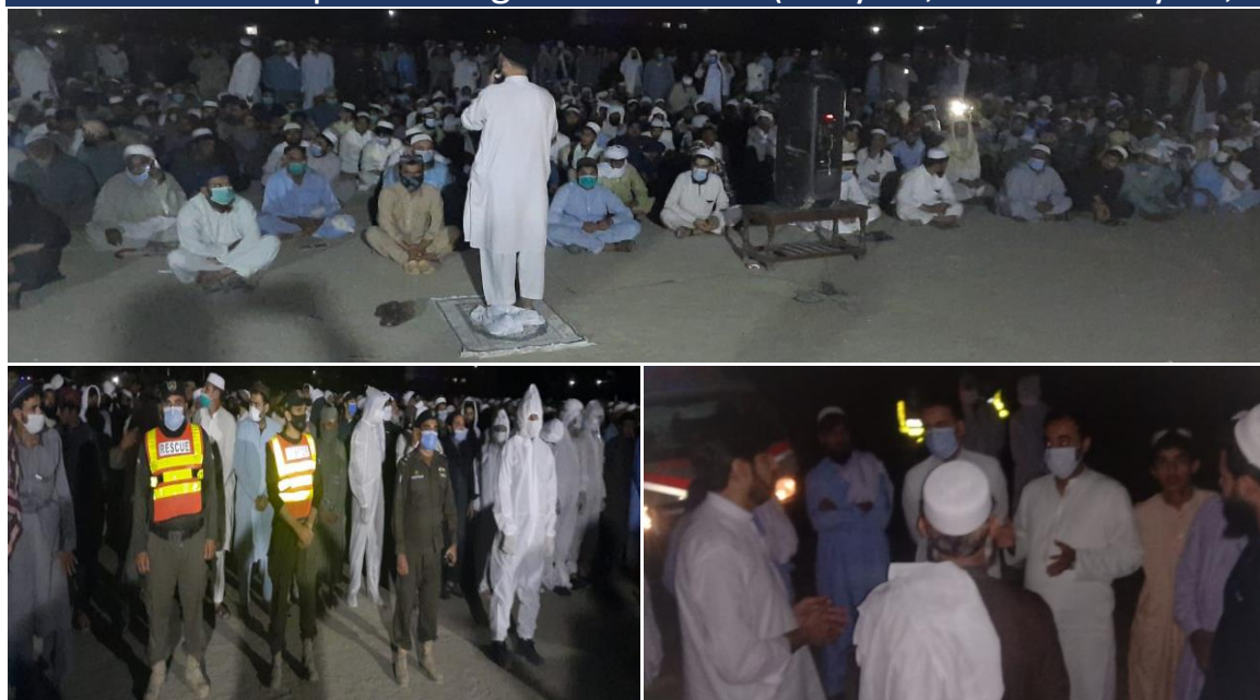
The above figures shows the IDSRS surveillance and response to CCHF confirmed case at district Lakki Marwat

Epidemiological Week - 19 ( May 10, 2021 to May 16, 2021)